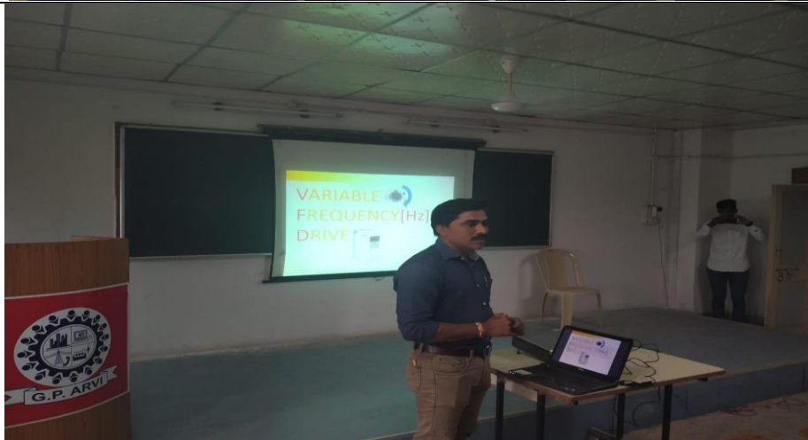
Expert Lecture on Variable Frequency drives Dt: 23/09/19