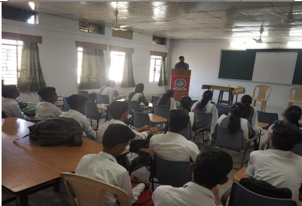
Advance communicati on & Their application Dt: 18/02/2020