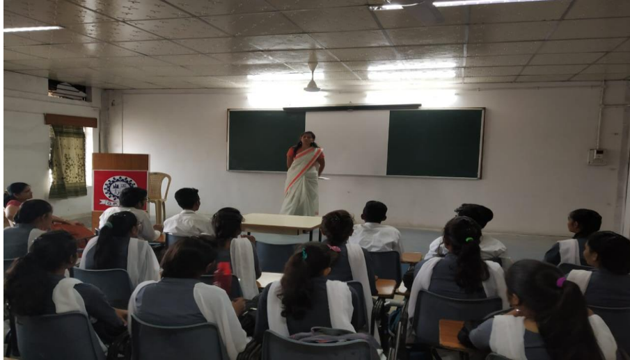
Expert Lecture on Carrier Guidance Dt. 19/09/19